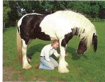
Tracie & Sailor have a trusting relationship