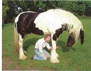
Tracie & Sailor have a trusting relationship